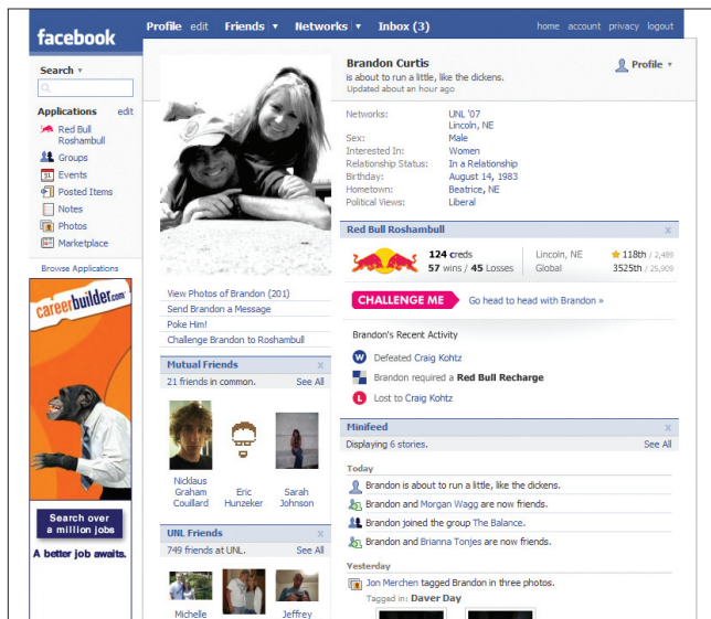
Screen capture of Red Bull Application