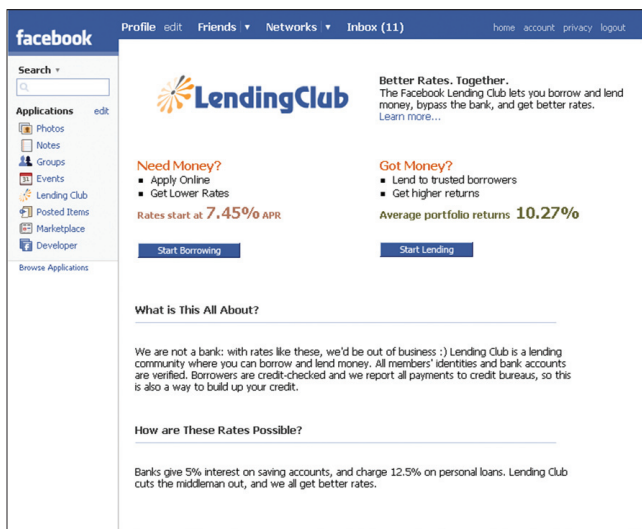
Screen capture of Lending Club Application.